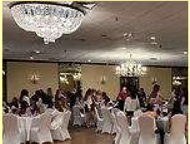
White Eagle Events and Convention Center