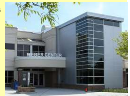
Weber Leisure Center

The sectional on the schedule is the ever popular Labor Day event which returns this year to the convenient Weber Leisure Center, 9300 Weber Park Pl, Skokie. The tournament will run from August 31-September 2.